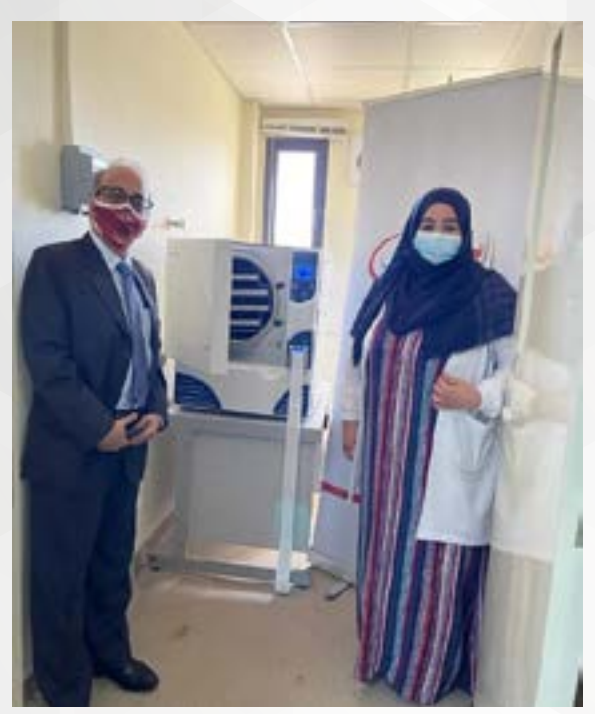
Sterilizing equipment donated to the primary health center and clinic at Barka